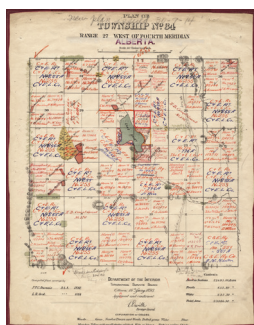
Township map for Township 34, Range 27, West of the 4th Meridian. GR2004.0214/1958

Township maps date back to when the land was first surveyed. Some township maps were annotated to include the names of the people who successfully homesteaded particular parcels of land. The Provincial Archives of Alberta has a series of township maps (arranged by township, range and meridians) that identify homesteaders, not subsequent land owners.