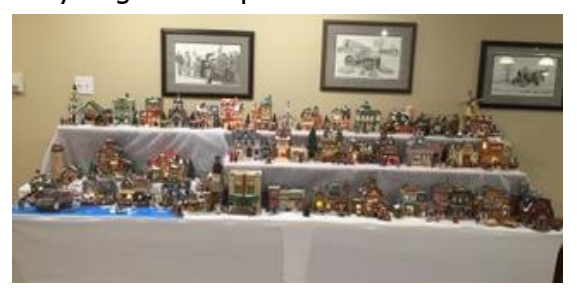
then on a larger table